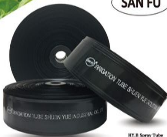
HY.B Spray Tube